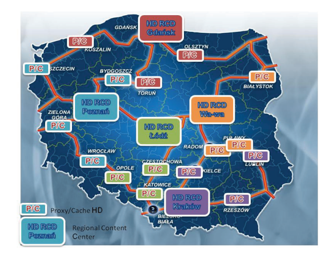
Fig. 2. Content delivery infrastructure in the PIONIER network

The content delivery system, based on a two-level hierarchical architecture, will consist of 5 regional content centers and 72 proxy/cache servers (in total), deployed in MAN's, responsible for media services delivery to the end-users (Fig. 2). The CDS will be able to serve at least 10 000 concurrent users, considering the single HD stream at 10 Mbps.