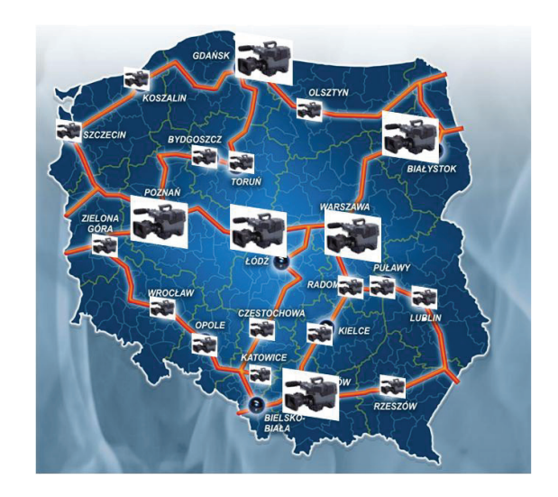
Fig. 1. Media production infrastructure in the PIONIER network

To support media production, 6 production studios, 15 recording studios and 1 outside broadcast van (ob-van) are planned to be deployed in MAN and HPC centres (Fig. 1).